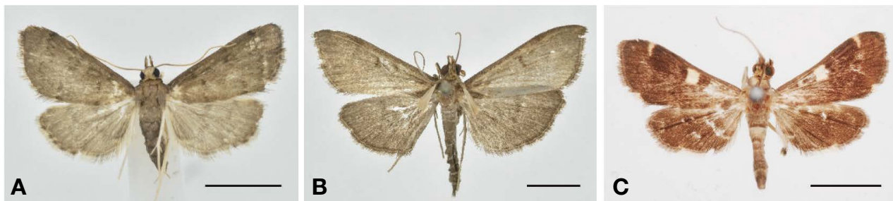
Fig. 1. Adults of Crambidae. A, Camptomastix septentrionalis Inoue; B, Omiodes indistinctus (Warren); C, Piletocera aegimiusalis (Walker). Scale bars: A-C=5 mm.