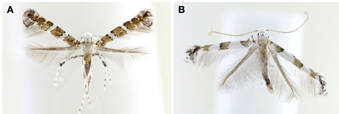
Fig. 1. Adults. A, Telamoptilia grewiae ; B, T. tiliae .

Dark ochreous to fuscous forewing ground color with blackish edged white fasciae; darker and more fuscous costa basal margin than ground color; first fascia reaches the wing fold; second fascia reaches just before median to base and third fascia distal to median; two whitish strigular on costal and dorsal margin with black edges; 4–5 white spots along apex to tornus and black apex; gray ochreous cilia on the outer